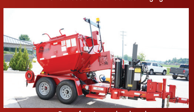
Dump function and tack tank

*Additional options available upon request