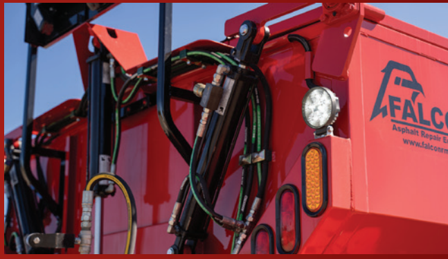
Hydraulic loading and unloading doors