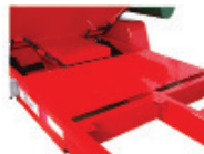
Platform For Safe, Easy Hopper Access