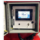
Digital Controller with V.I.P. Technology

Falcon Asphalt Repair Equipment 2600 W. Salzburg Rd. Freeland, MI 48623 sales@falconrme.com