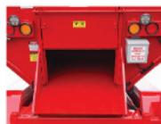
Large Material Unloading Door for Easy Access