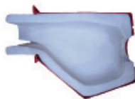
Patented Heat Management System